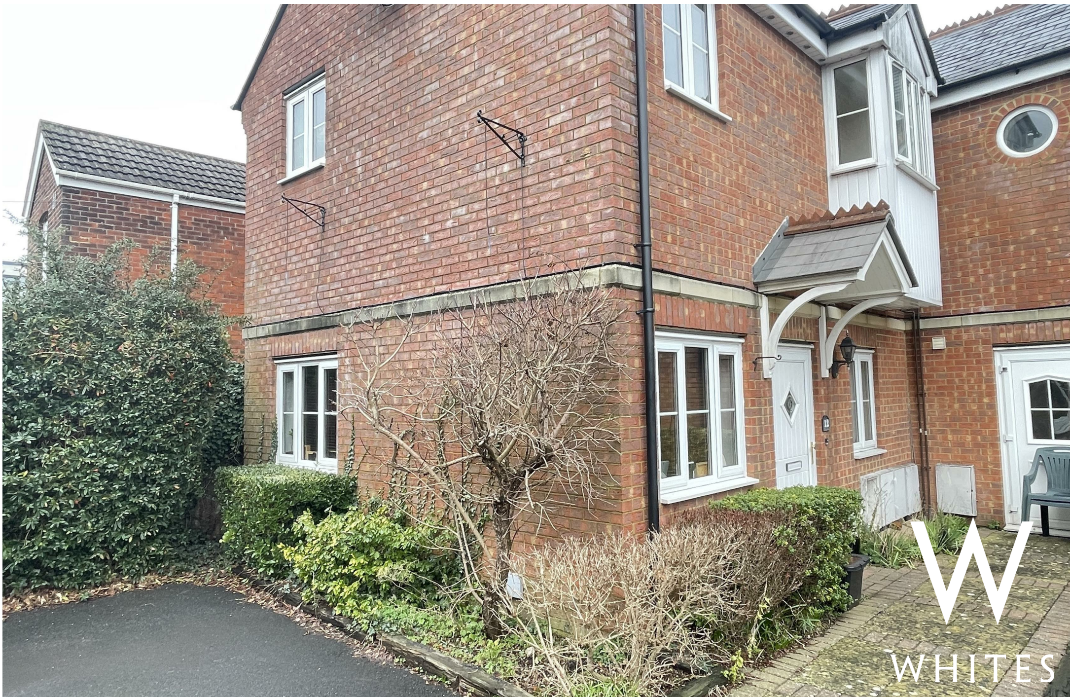
Flat 12, Railway Court Windsor Road, Salisbury, Wiltshire, SP2 7AR